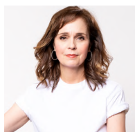
CYNTHIA DALE (she/her) Writer & Star

Cynthia Dale is one of Canada's most acclaimed and